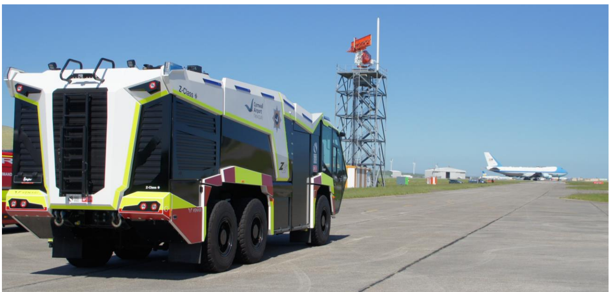
The Z-Class at the G7 Summit at Cornwall airport